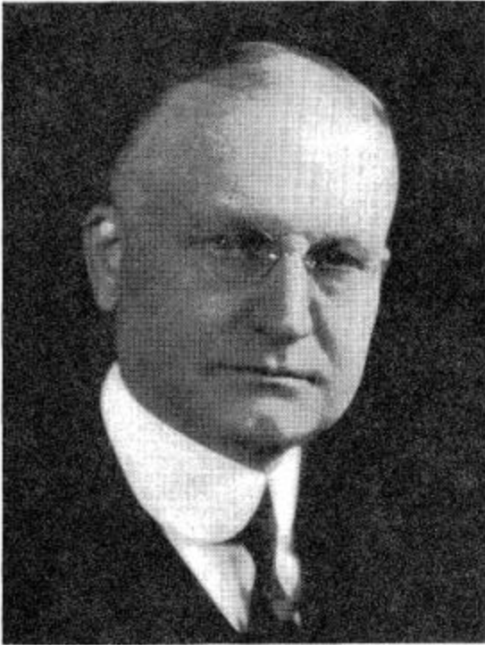
Col. Edward A. Deeds

Chairman of the Board of Directors of Pratt & Whitney Co. and Niles- Bement-Pond Co.